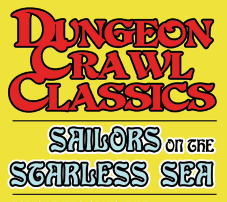
#67: A LEVEL 0 ADVENTURE BY HARLEY STROH

Since time immemorial, you and your people have toiled in the shadow of the cyclopean ruins. Of mysterious origins and the source of many a superstition, they have always been considered a secret best left unknown by the folk of your hamlet.