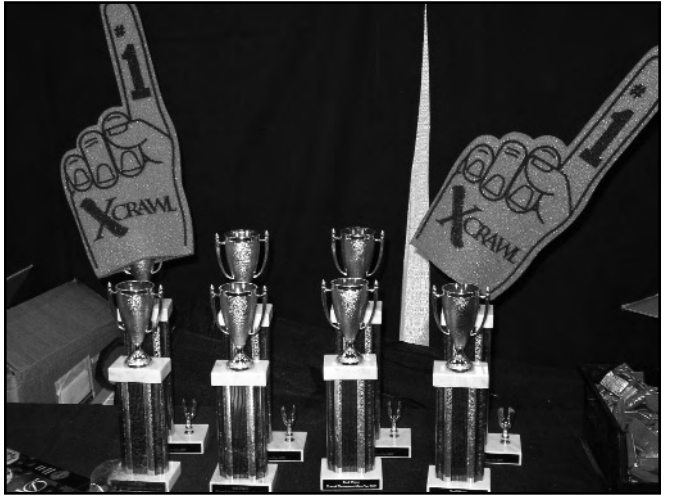
The coveted tournament trophies, along with the giant "Xcrawl is #1!" foam hands that were the envy of everyone at Gen Con.

Goodman Games is the leading publisher of tournament dungeon crawls, including the one you hold in your hand! The PhoenixCrawl Open was originally run as an open tournament at Gen Con 2007 in Indianapolis, Indiana. Eight teams competed for the opportunity to conquer the dungeon and have their scores immortalized in this module! Here are some pictures from the event.