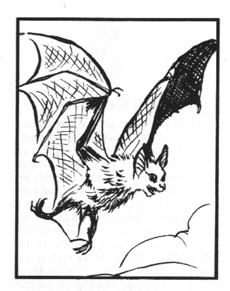
The Sorceress in Silver

Human female mage — age 36, curly black hair, gray eyes, fair complexion. 5' 6", 135 lbs.