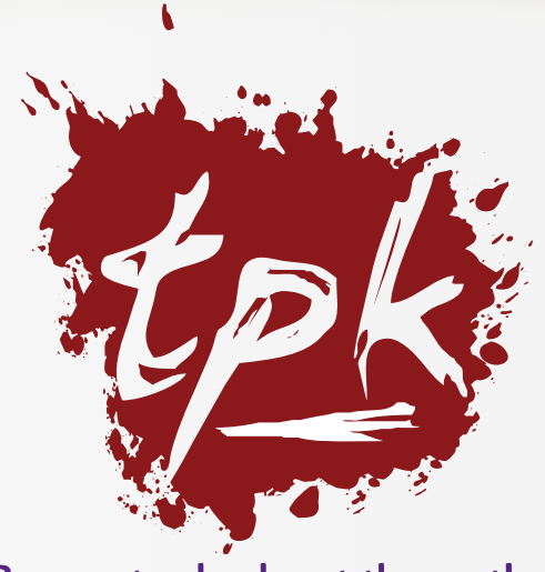
Be sure to check out these other great titles from TPK Productions!